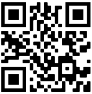
Instruction video on how to provide a DLA

A quick hint in between: What is the difference between Mobility-Online and C@MPUS?